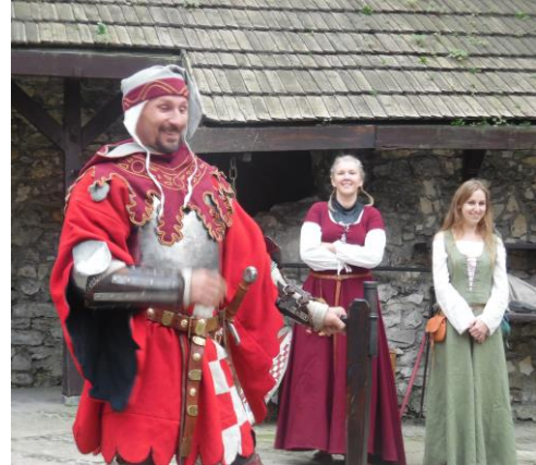
..... and its inhabitants