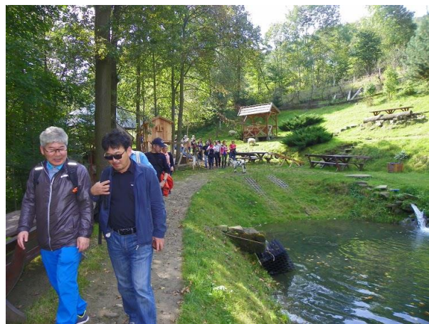
At the trout farm