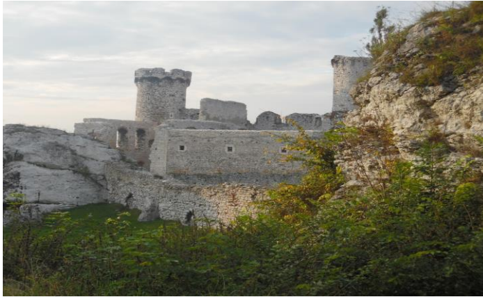
The Ogrodzieniec castle

For the participants of workshops and the 5 th Seed Health Conference who could not take part in the trips of the field day, a special scientific trip was organized to the Ojców National Park (with unique flora and fauna among amazing lime rocks with fossils, presented and described by Prof. Bogdan Wiśniowski) and to the castle of Ogrodzieniec, where they were received by medieval ladies and knights. They also visited the Błędów Desert, the biggest inland desert in Europe. The meeting was concluded in one of Kraków restaurants serving traditional Polish cuisine.