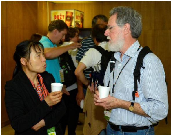
First meetings and talks

On first conference day evening an All-together introductory meeting took place which was an opportunity to meet colleagues and to enjoy Polish folk songs and dances. The conference participants were “blessed” with the Lajkonik’s scepter.