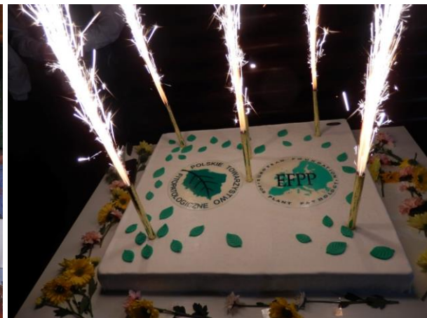
At the gala dinner in the Warsaw Chamber plant pathologists were nominated honorary guests of Wieliczka Salt Mine