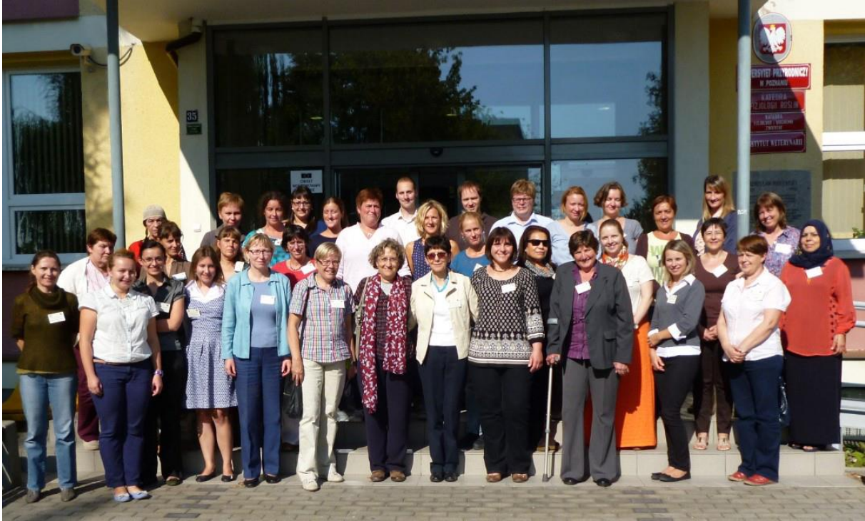
Participants of the ISTA Seed Health Testing Workshop in Poznań

The conference was preceded by the ISTA Seed Health Testing Workshop, held at the Poznań University of Life Sciences, from 4 th to 7 th September. It was attended by 30 participants from 14 countries, with 6 invited speakers from 5 countries. The participants had a thorough training in diagnostics of seed pathogens.