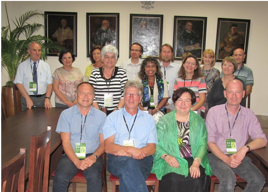
The EFPP Board and guests at the 11 th EFPP Conference in Kraków