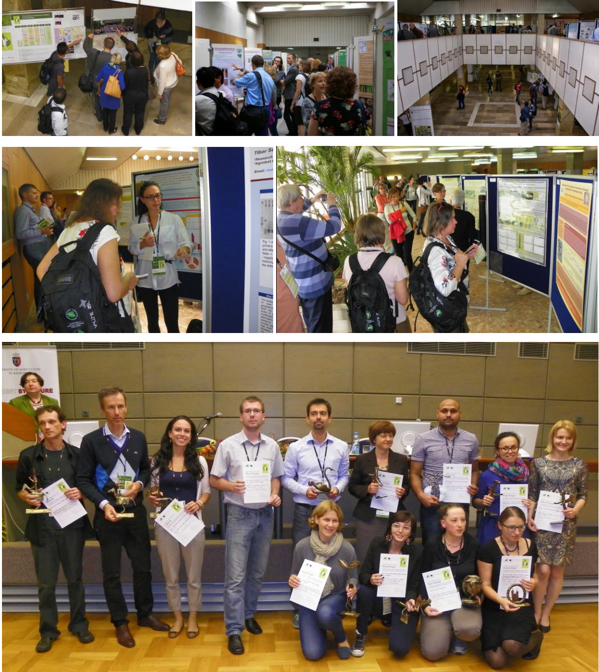
Photo 18. Best Poster Award winners at 11 EFPP Conference in Kraków