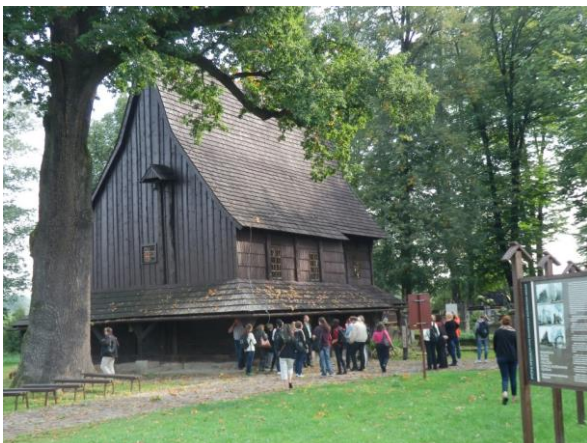
St. Leonard's church

On the way from Kraków to Żmiąca, the first stop was in an old traditional village Lipnica Murowana. A wooden St. Leonard's church from XII/XIII century with magnificent painting on the inner walls was to admire there.