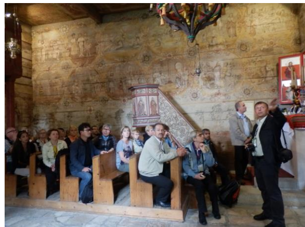
Inside St. Leonard's church