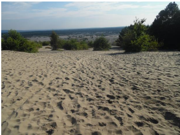
The Błędów Desert