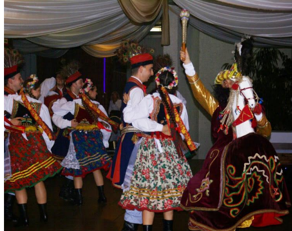
Kraków dance and Lajkonik (on right)

There was also a special session in Wieliczka Salt Mine , with a lecture on biological monitoring in the treatment salt chambers of the Wieliczka Salt Mine Health Resort and a lecture reminding previous EFPP conferences. This special session and conference dinner took place in Warsaw Chamber of this mine, 120 meters below the ground level, with the floors, ceiling and walls, made up by salt rock.