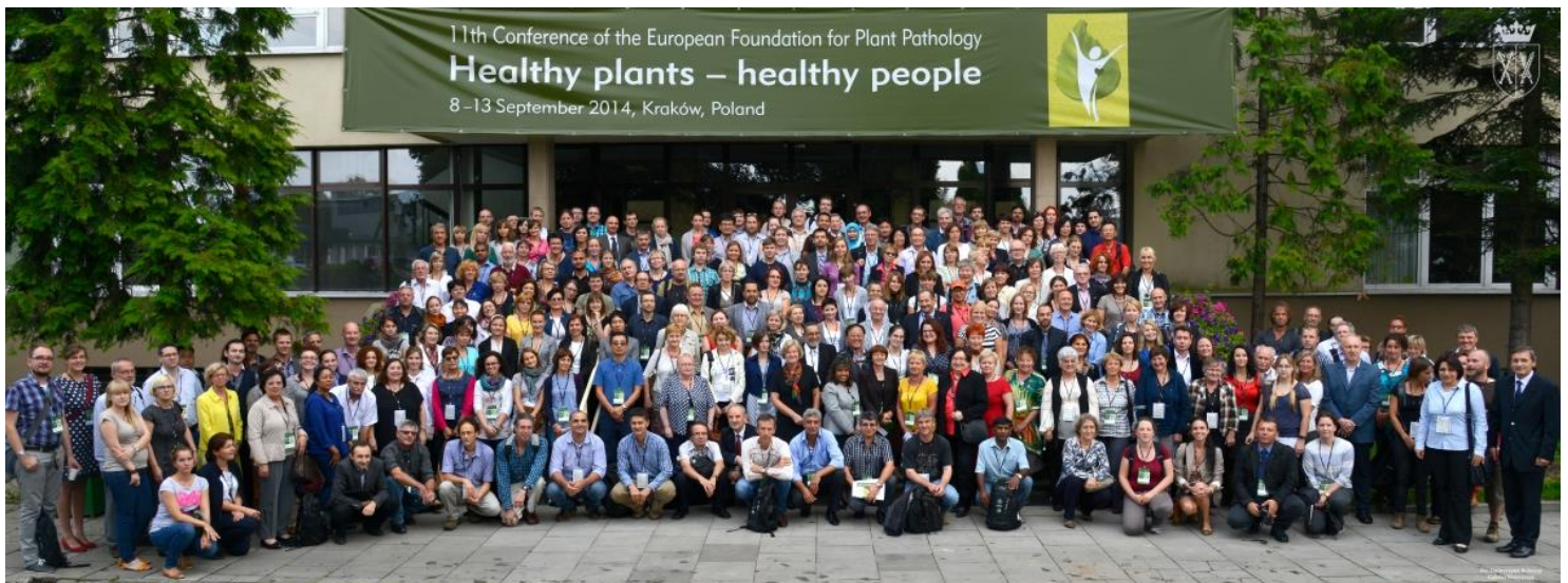
Participants of the 11 th EFPP Conference in Kraków