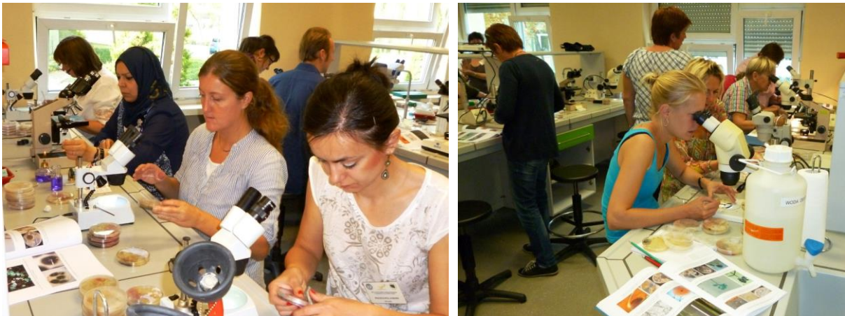
Training in diagnostics of seed pathogens at the ISTA Seed Health Testing Workshop