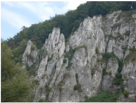
Hand of God