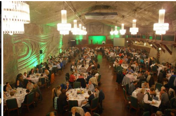
The miners’ orchestra and the gala dinner in the Warsaw Chamber