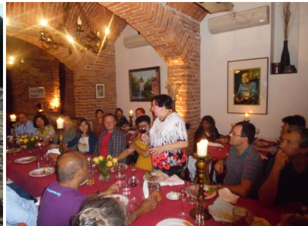
The farewell dinner

We hope that the conference was a good forum for presenting recent research results and exchanging ideas on subjects of mutual interest and it also improved personal friendship between researchers from different countries.